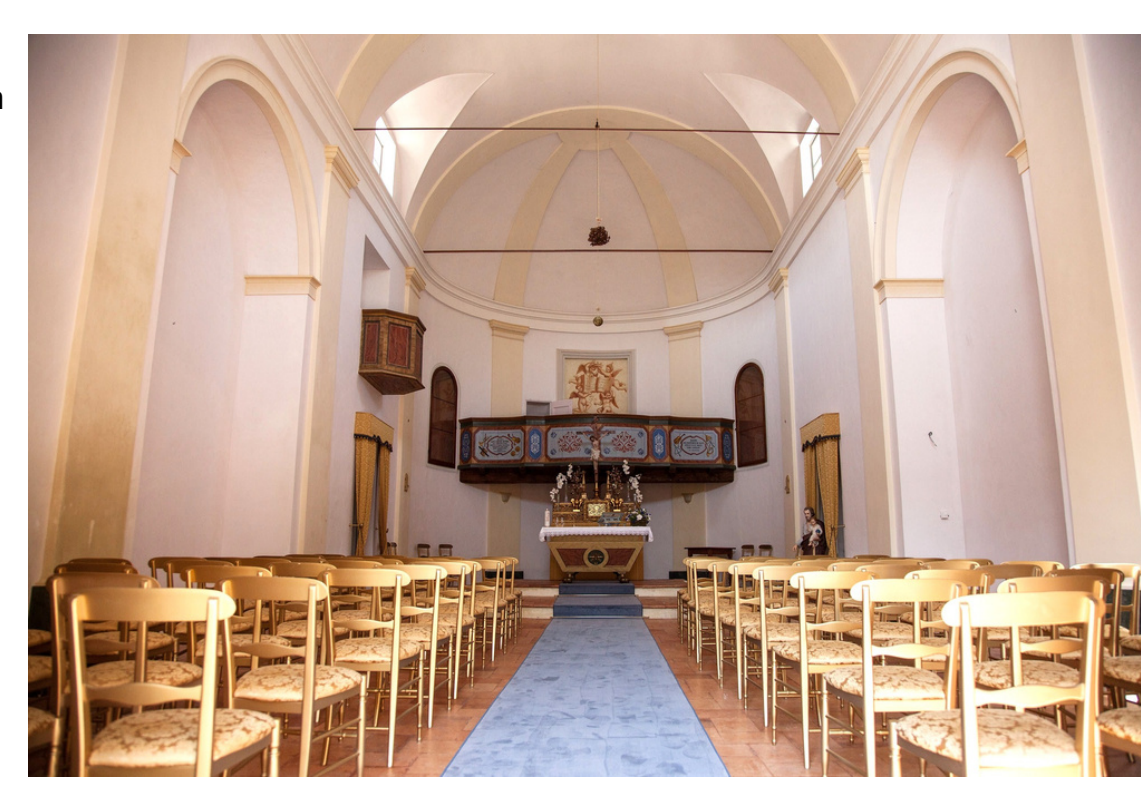
The Pieve San Quirico castle church. It features 11 m. high vaulted ceilings.

The nearest village is a 5-minute drive away, where you'll find restaurants, local shops, Tennis court and Horse riding, while an 18-hole golf course designed by Robert Trent Jones Jr. is just 10 minutes away.