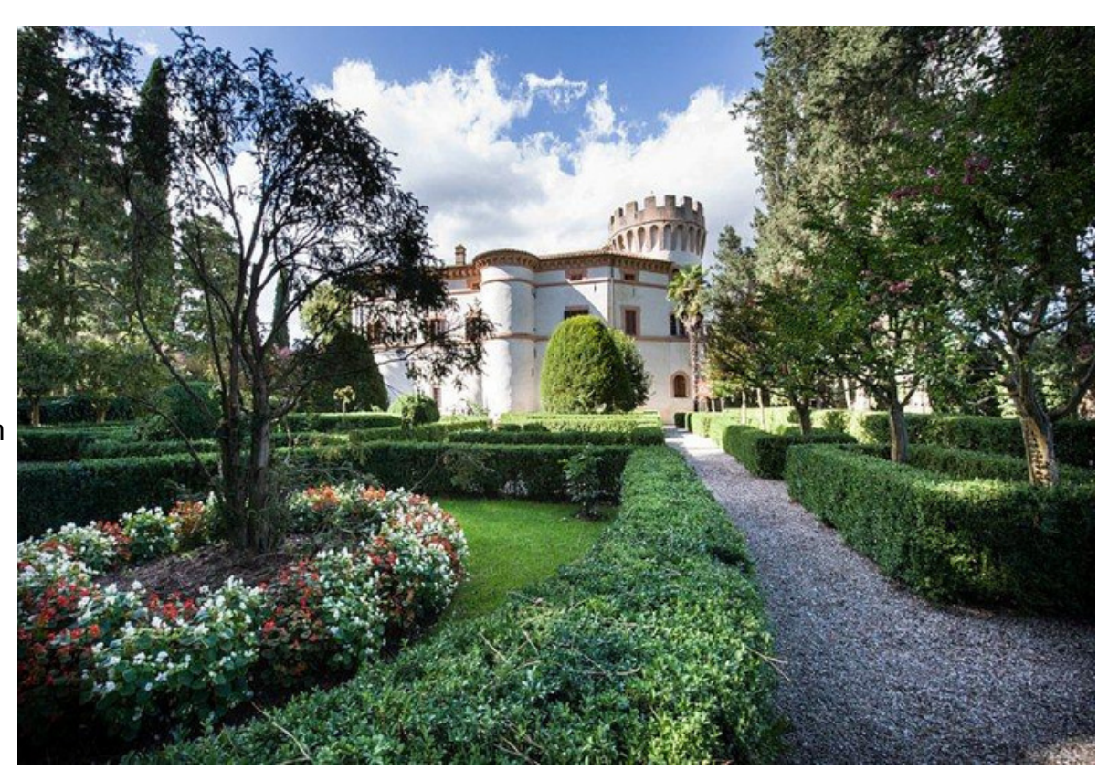
The Castello di Bagnara front view and the Italianate Garden.