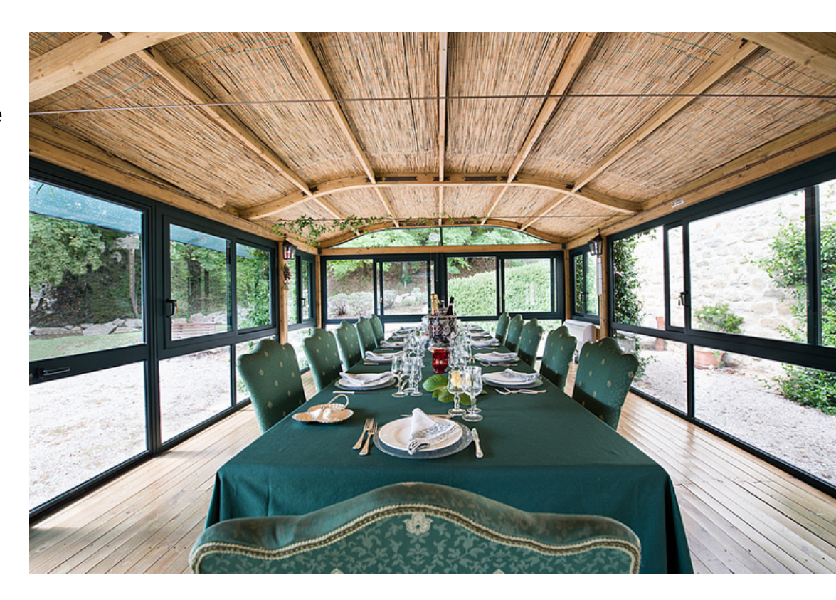
The Pieve San Quirico castle (main house), panoramic jasmine covered Dining Veranda. The glass walls offer 4-side terrific views over the gardens, surrounding hills and the Tiber valley.

Pieve San Quirico castle is licensed for on-site civil wedding celebrations.